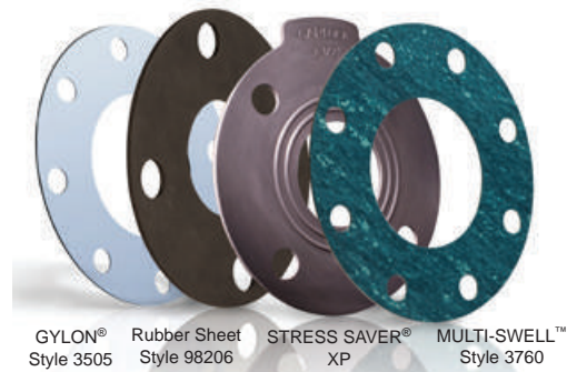
GYLON® Style 3505 Rubber Sheet Style 98206 STRESS SAVER® XP MULTI-SWELL™ Style 3760

NOTE: 1 Based on ANSI RF Flanges at our preferred torque. When approaching maximum pressure, temperature or 50% of maximum PxT, consult Garlock Engineering.